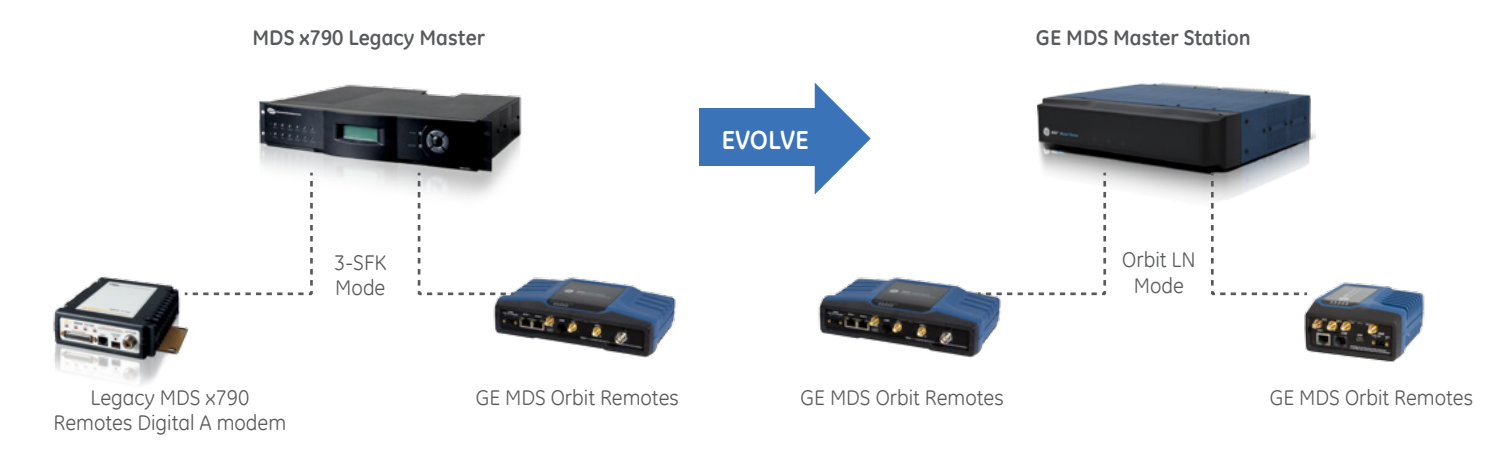
Figure 3: Backwards compatibility firmware in the GE MDS Orbit remote, allowing x710 networks to migrate to the MDS Orbit Platform through the legacy Master Station.