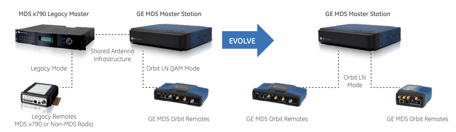
Figure 4: Co-Existence through the GE MDS Master Station with evolution technology allowing x710, SD, or other licensed frequency equipment to immediately co-exist with the MDS Orbit Platform remotes.